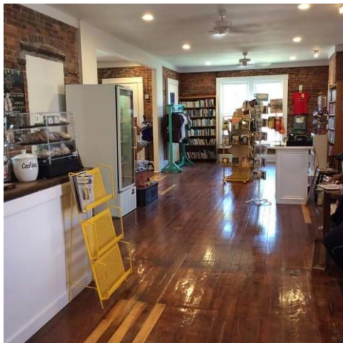
Where I will be one year from now!