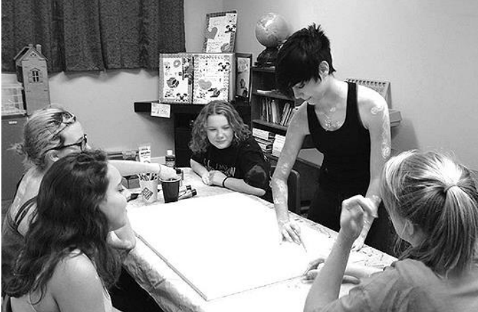
The teens collaborate on their art installation.